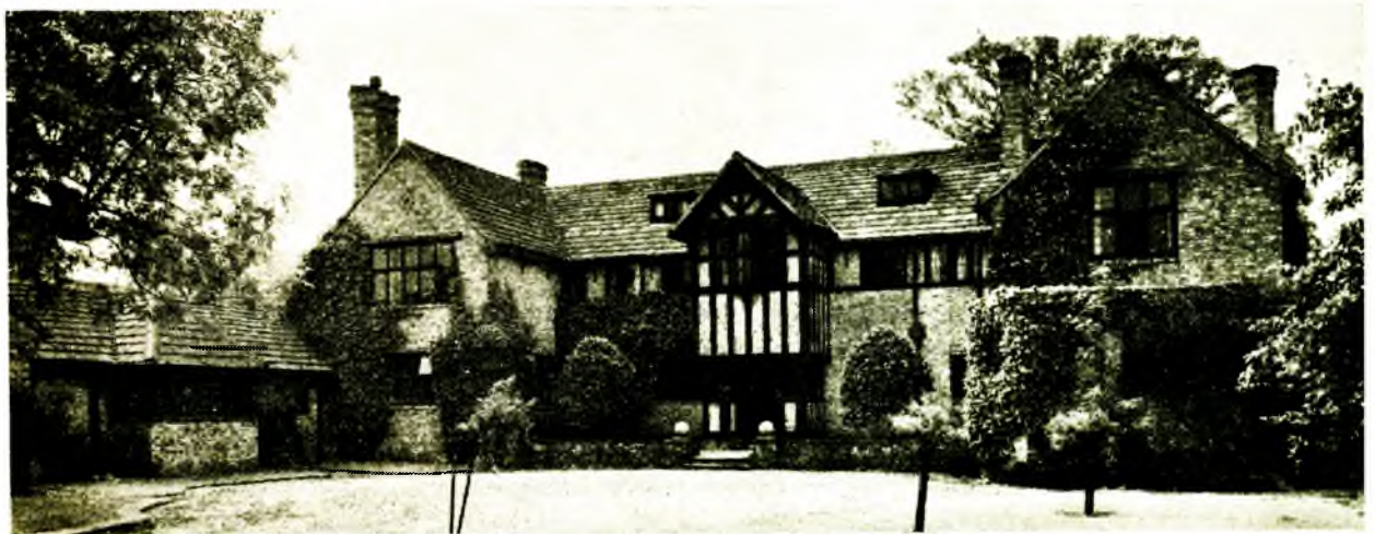
British Isles Nazarene College

The proposed addition would have twenty single rooms as living quarters for students. This would make it possible to serve a resident enrollment up to fifty. Leaders hope to build a separate wing for use as a library a little later.