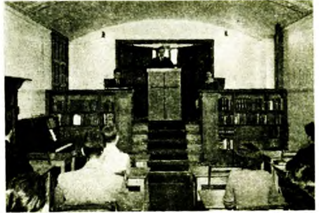
Lecture Room, British Isles Nazarene College

The estate is the former home of the Godlee family, long associated with the internationally known Halle orchestra. The main building is a large, handsome brick structure in Tudor style. The music room will be converted into an assembly