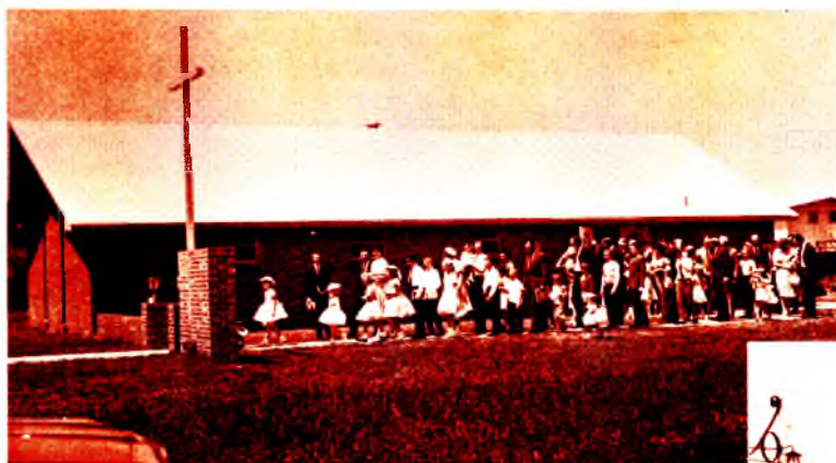
Haltom City congregation on Easter Sunday, 1963.