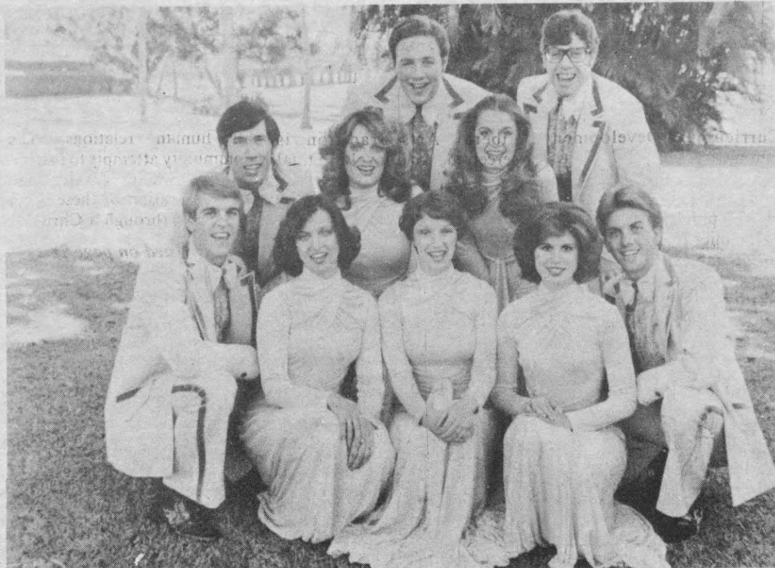
The Re'Generation, who will appear in a special benefit concert sponsored by Circle K in the P.E. Center at 7:30 pm on April 21st.