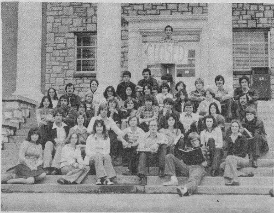
1977-78 TNC Honor Society

to make such a decision. The right of prior approval is not included in the ASB Constitution as is forbidden in the Joint Statement on Rights and Freedoms of Students , which is official school policy.