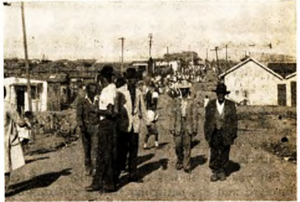
A street in a native slum, before new location homes were built.