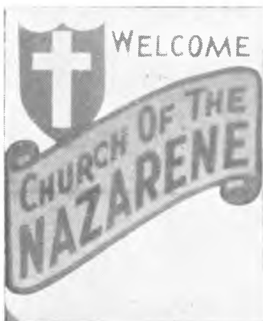
Size, 24 x 30 inches

The Progressive Church Advertises The Advertising Church Progresses